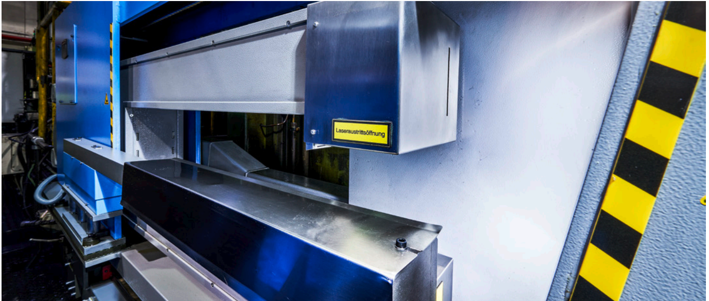
Figure 4. The C-frame of the VTLG in parking position

into the line and on its way there measures the thickness of four captive DAkkS-certified gauge blocks representing the thickness spectrum of the mill. The VTLG thus constantly monitors itself and makes any necessary corrections automatically.