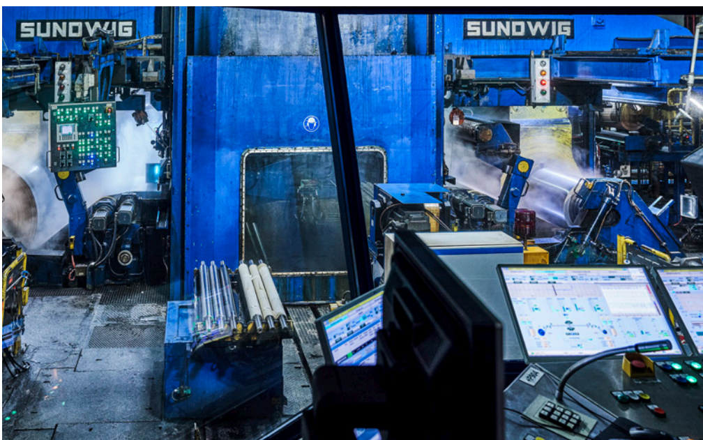
Figure 1. The “Sundwig 1350” 20-high cold rolling mill at the Dillenburg works. The VTLG can be recognised from the light blue indicator light on the mill to the right of the control panel

The specialists from Vollmer, however, were very confident that the VTLG laser-optical thickness measuring system would also work reliably on the Dillenburg